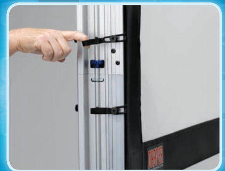
Viewing surface attaches with DuraLoops

Viewing surfaces are available in Black-Backed M1300 for front projection. For rear projection, Cineflex and Low-Gain Cineflex neutral gray surfaces are available. Uniflex White viewing surface is suitable for either front or rear projection, and is ideal for edge blending. Custom surfaces and sizes are available.