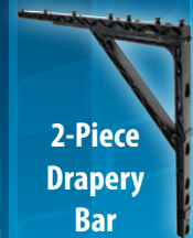
2-Piece Drapery Bar