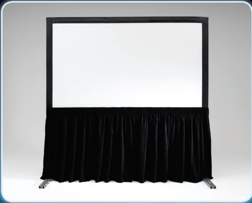
FocalPoint with Dress Kit Skirt