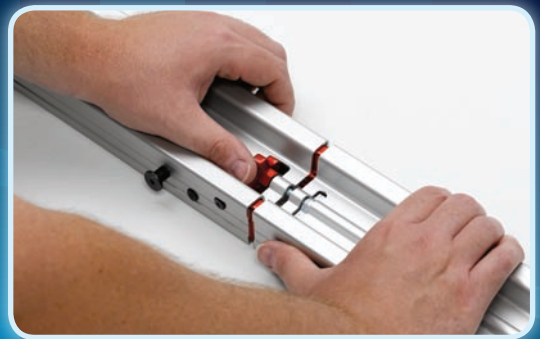
Easy frame assembly