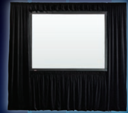
Complete Dress Kit