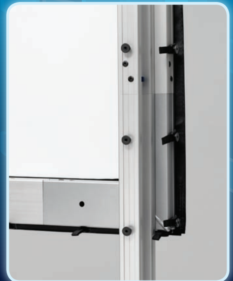
Viewing surface border provides a finished appearance