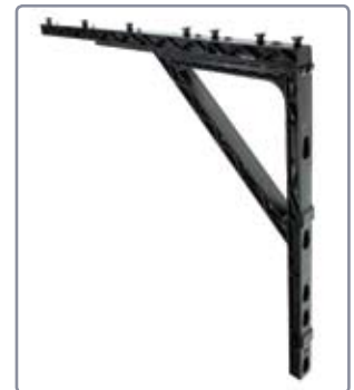
2-Piece Wing Bar