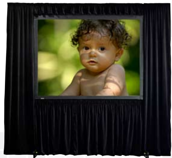
NTSC format StageScreen with black frame, legs and complete Dress Kit