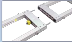
Frame Section Connections (silver or black frame available)

No hinges, no snaps, and no Handy Cranks are involved. Frame sections are connected with permanently attached threaded links and guide pins. Easy to follow color-coded assembly instructions are included with each StageScreen. Each frame segment is clearly labeled and color-coded. Print color-coded instructions in standard or custom sizes from our website and even see sizes that can be created from existing frame inventory. Visit www.draperinc.com/stagescreen/build.aspx to learn more!