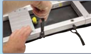
DuraLoop Screen Surface Attachment