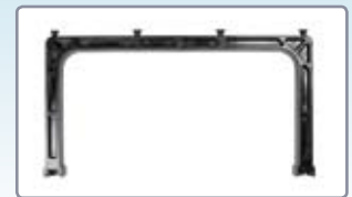
Valance Bar Section

Custom valance corners are available to accommodate wider side drapes which utilize standard StageScreen frame sections. Call for details.