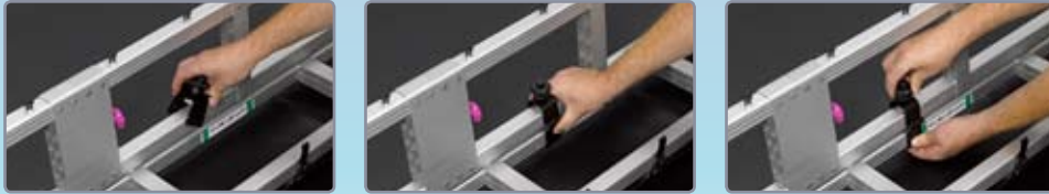
Attaching legs to a StageScreen is simple and fast with its leg clamps.

Our unique leg clamps allow universal height adjustment and easily secure the weight of the screen frame, surface and optional dress kit. Legs available in black or silver finish.